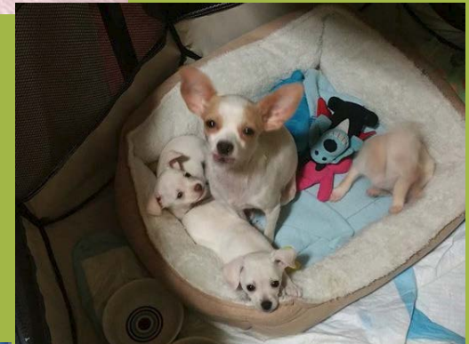
Sweet mama & her three pups, Huey, Dewey & Louie.