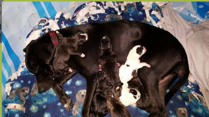
Meeka & Babies