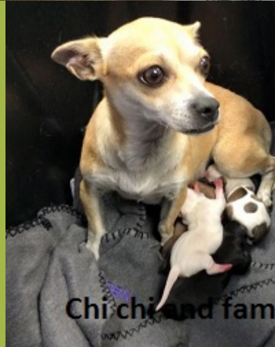
Chi chi and fam

Sadly, the most at risk animal in a high kill shelter is moms with babies. OFOSA takes in about 500 litters a year.